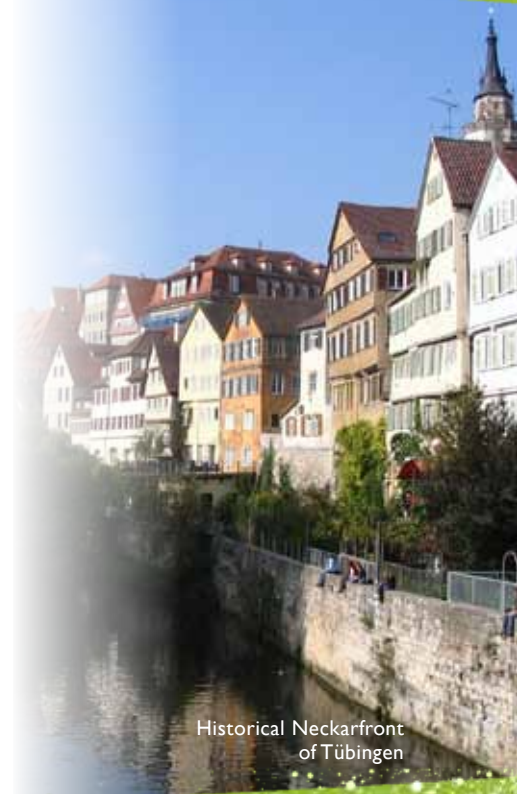
Historical Neckarfront of Tübingen

Be part of the World Student Environmental Summit and facilitate positive change!